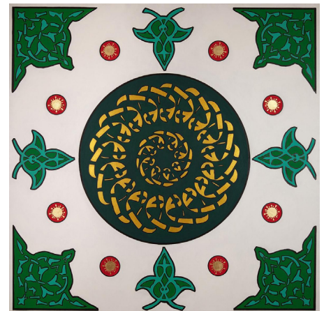
God Bless III Acrylic On Paint 120cm x 120cm 2021